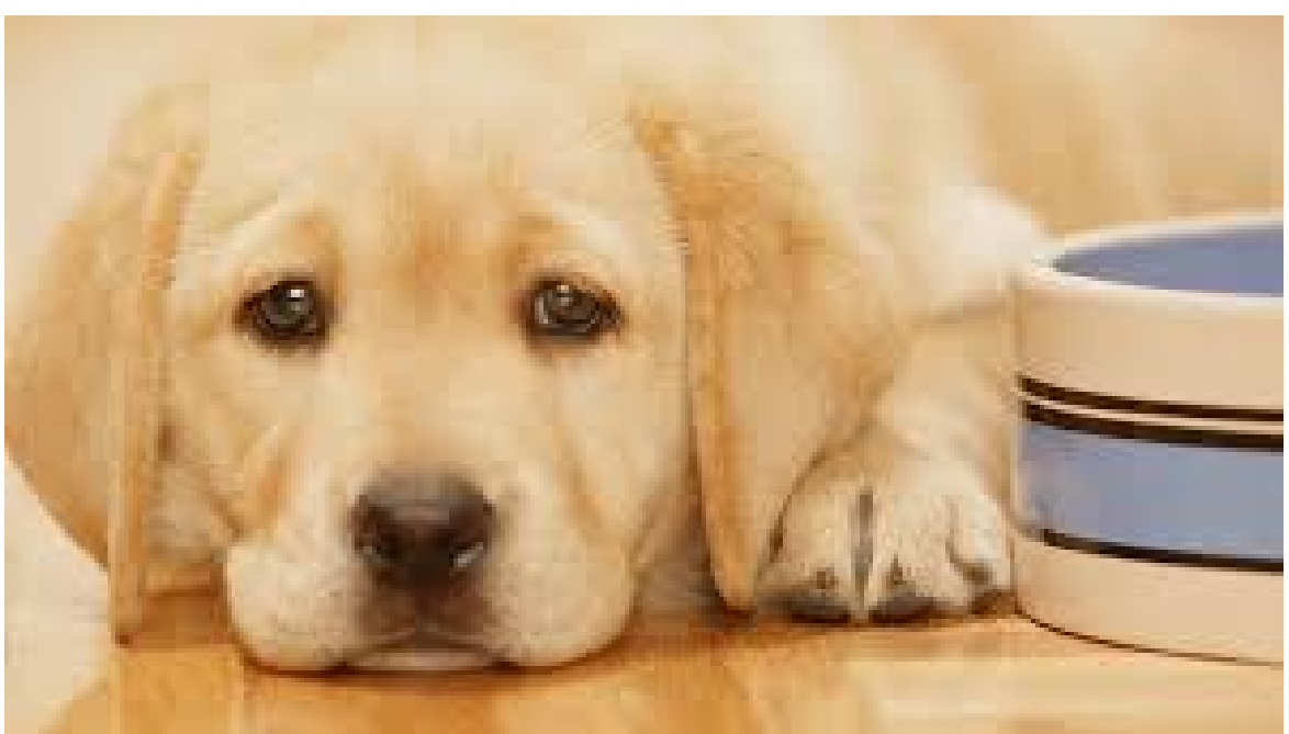
Have you ever wondered how to go from taking snapshots, to taking "real" dog photos, that convey the love of your pup?

That was exactly the question I asked myself when I realized that I had hundreds of pictures of my dogs, most of which hadn't come out the way I'd planned and weren't the shots I'd