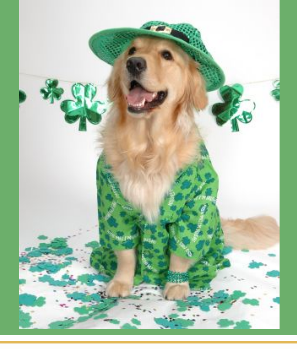
5 Simple Steps To Make Your Dog Photos Great By Dogs Are Love On 4 Legs