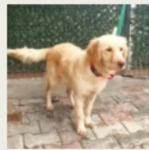
Name: Sloane Gender: Female Age: 2 year Sponsored by: Kelly Topfer