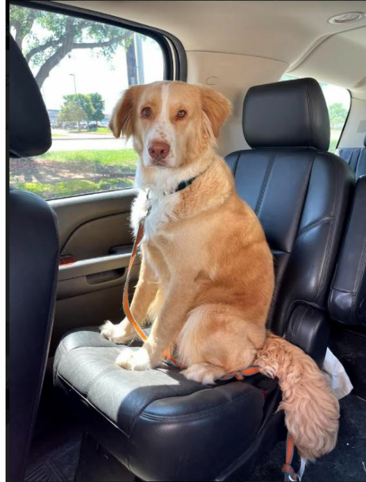
On her way to her forever home