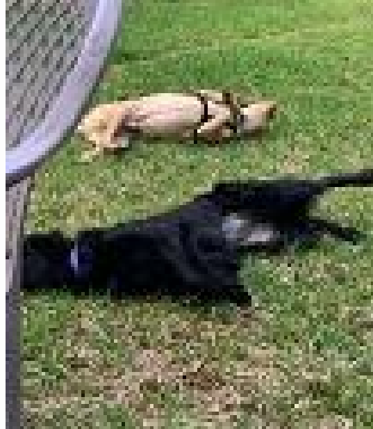
Tummies up! Totally trusting!